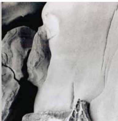
Perception as an Equivalence Experience