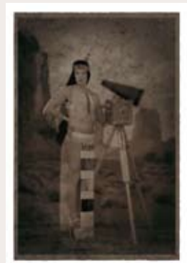
Miss Chief: Emergence of a Legend by Kent Monkman