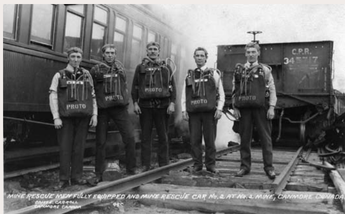
Mine Rescue Men by Daisy Carroll

Exposure 2010 is a one-month opportunity to alter perceptions, and visiting one of the participating galleries and attending the special events are the perfect ways to start. •