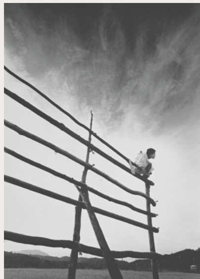
Kakmaitachi #8, 1965 by Eiko Hosoe