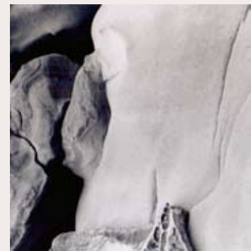
Rock Formation: Galiano Island by Jim McElroy