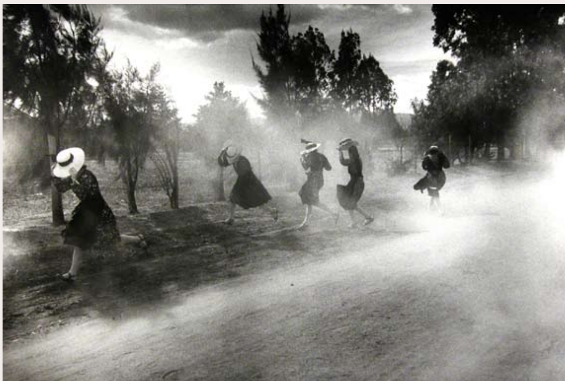
Dust Storm, Durango Colony, Durango, Mexico, 1994