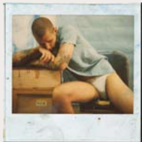
Attila Richard Lukacs After Goya (detail), n.d. 12 Polaroid photographs

Gallery 371, ACAD, 1407 – 14th Avenue N.W., Calgary AB acad.ab.ca/happening.html T: 403-284-7613