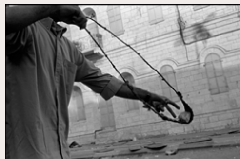
Bethlehem, West Bank, 2000

1800 – 8th Avenue, Canmore AB Sunday, February 7th, 3 p.m.