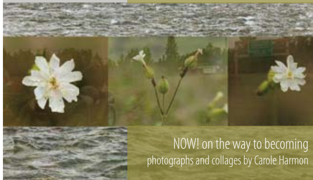
NOW! on the way to becoming photographs and collages by Carole Harmon

JOIN EXPOSURE 2010 OPENING NIGHT IN BANFF