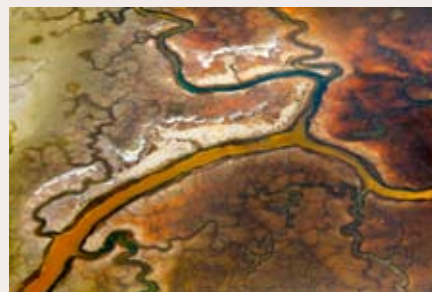
Submerged Landscape by Bill Peters

Opening Reception Saturday, February 6th, 7 – 9 p.m. Exhibition closes April 11th, 2010