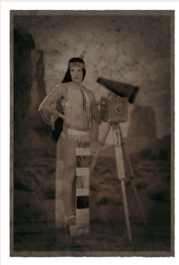
Miss Chief: Emergence of a Legend by Kent Monkman

Winnipeg artist Kent Monkman has dedicated his career to skewing our views on topics that have been layered by the weight of history, cultural ignorance and simplistic thinking. His photograph of a figure wearing a headdress and high heels exemplifies his ability to blow away stereotypes with a click of a shutter. In Miss Chief: Emergence of a Legend [one in a series of five chromogenic prints on metallic paper] the subject—presumably preparing to direct a scene with an antique movie camera—is wearing trappings of fashion from two distinct eras.