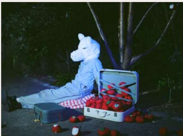
Wolf and Suitcase by Amalie Atkins

Perceptions of the world we think we understand and the world Monkman creates can be educative, unsettling and provocative. Evidence of altering perceptions are further confirmed when viewers discover that the model in the photograph is actually the photographer's alter ego Miss Chief .