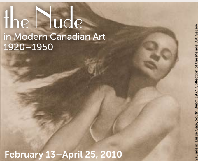
Saunders, Leslie Gale, South Wind , 1937, Collection of the Mendel Art Gallery