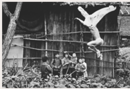
Eikoh Hosoe – Kamaitachi #17, 1965; gelatin silver print.

Opening Reception In the +15, Thursday, February 18th, 7 p.m.